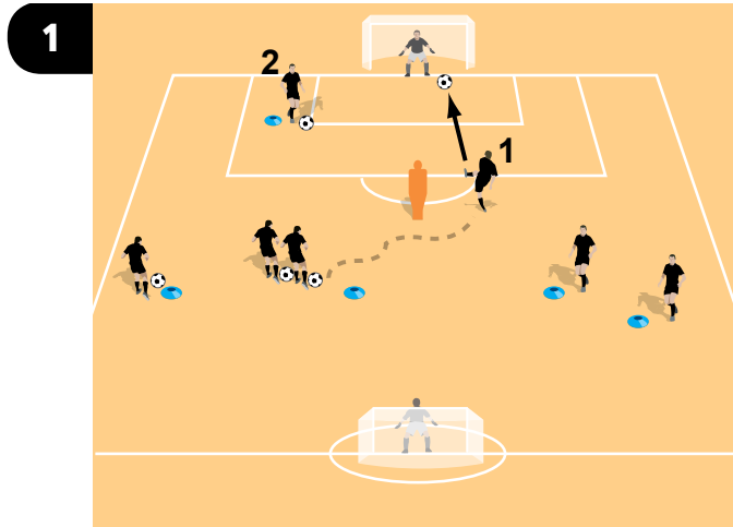
Player 1 is first to take a shot.